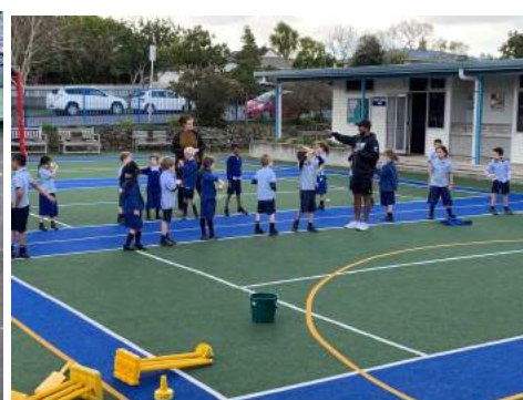
Room 12 learning to play Cricket With Nikheil from Grafton Cricket club